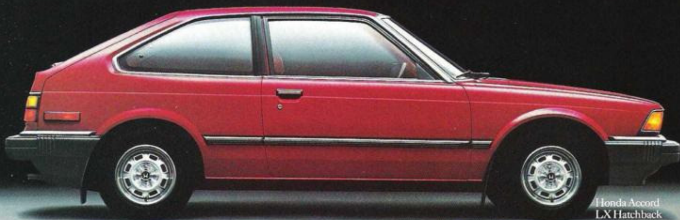
Honda Accord LX Hatchback

It takes a special automobile to inspire that kind of praise. A car like the affordable Honda Accord Hatchback, the luxurious Accord LX Hatchback or the comfortably convenient Accord 4-Door Sedan.