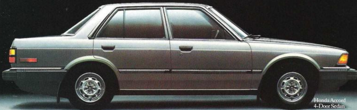
Honda Accord 4-Door Sedan